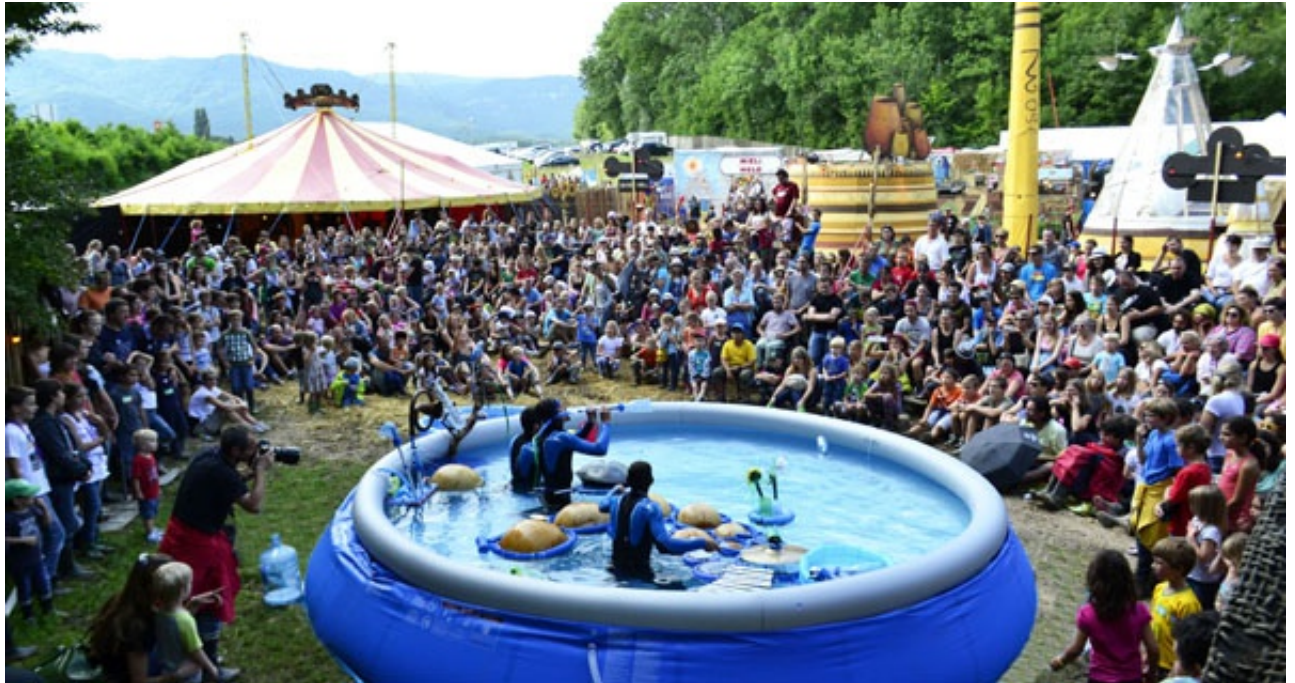
PALEO FESTIVAL, Nyon, SWITZERLAND, in an INTEX 5,5m diameter pool

This type of cheap pool can make it. You can install it anywhere (on a flat ground supporting 10000Kg)