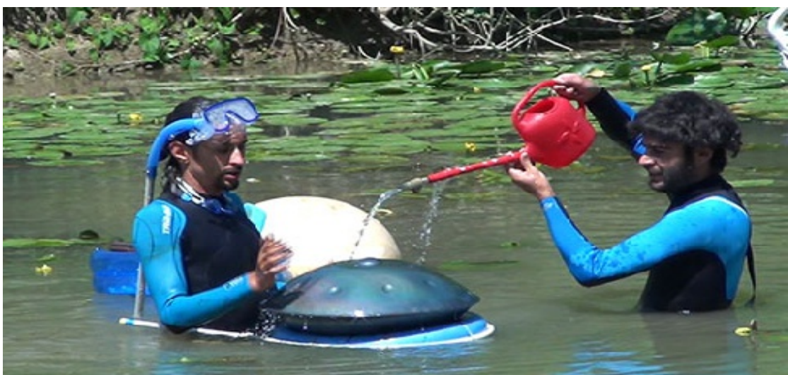
Saint Maurice sur Loir , France Floating on the river on our submarine stand.

Show for all ages. Can also be performed as a children's show from 4 years up. School shows are possible.