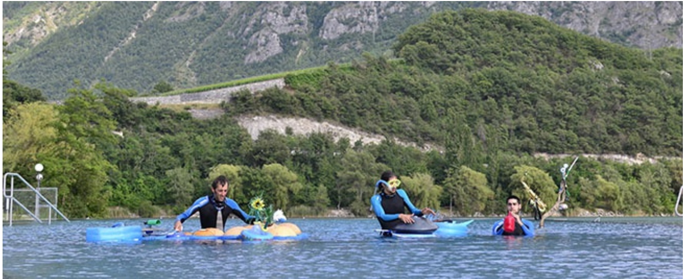
Sierre , Switzerland