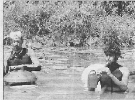
Un concert'eau plein d'humour.