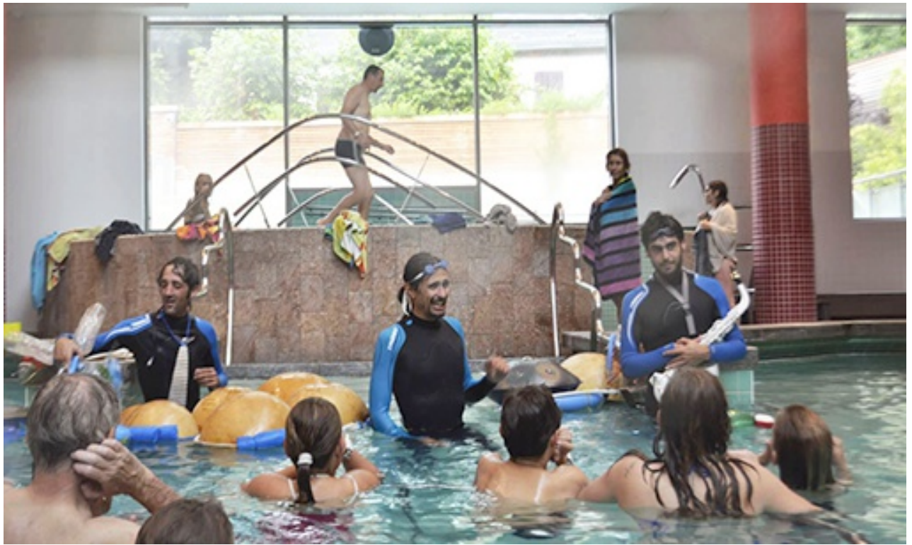
France Axe les Thermes : Thermal bath,