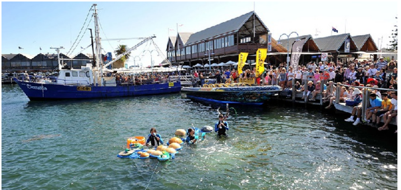
Fremantle , Australie