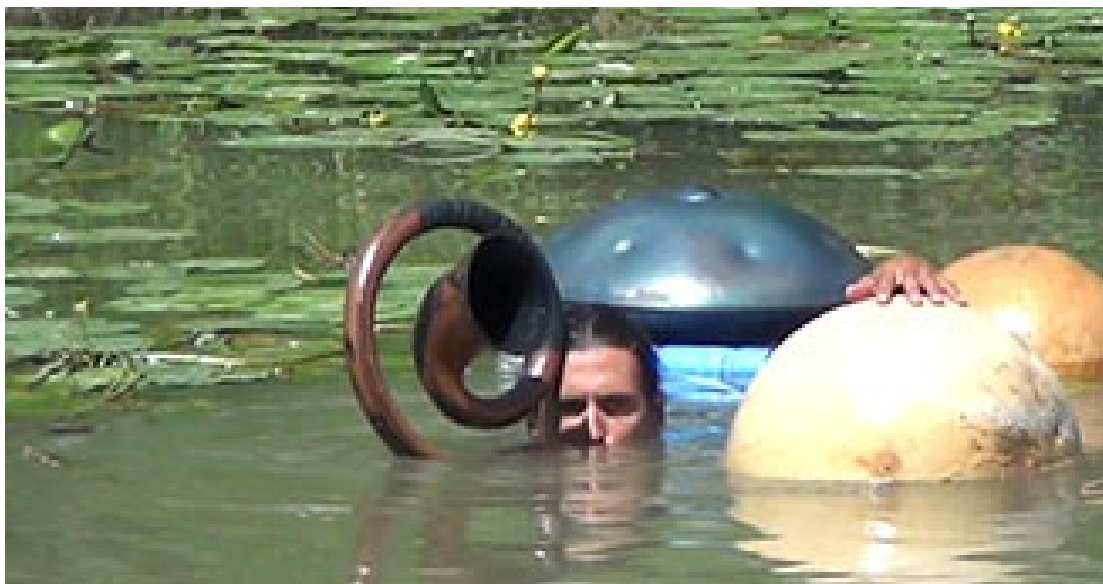
Playing underwater didgeridoo...