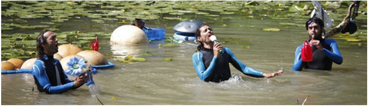
Chalon sur Saone, France, Internationnal Street art festival