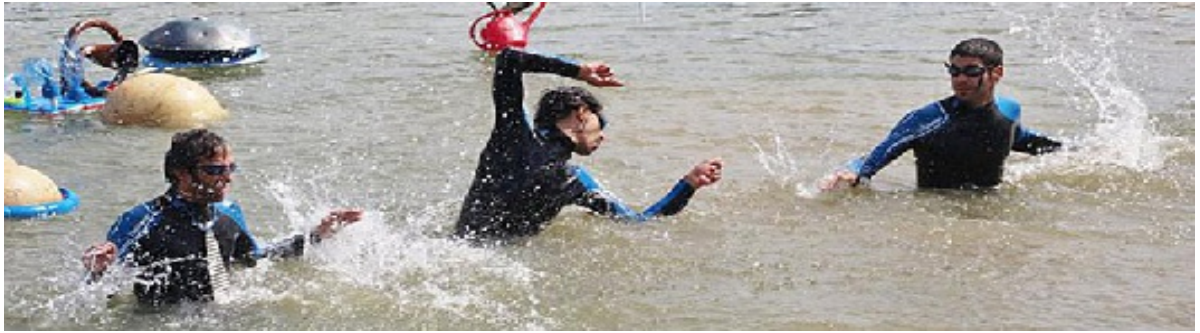
Aquacoustique playing Splash : water percussion.

The compositions and musical styles are inspired by various kinds of music: jazz, Beguine , Rap, Waltz , Afro beat and other traditional and ethnic sounds .